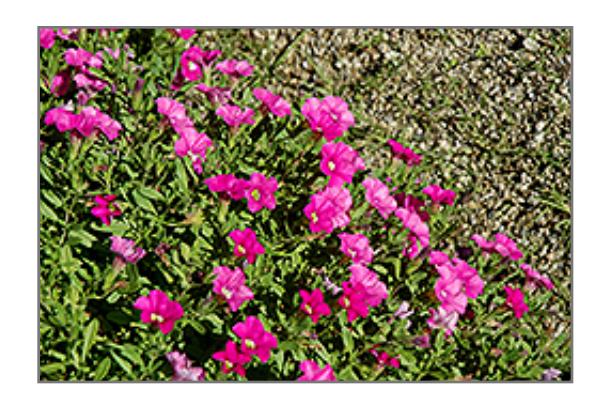
Noa Dark Pink Calibrachoa flowers