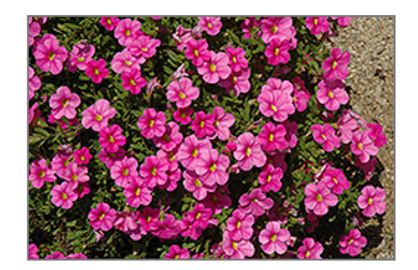
Noa Mega Pink Calibrachoa flowers