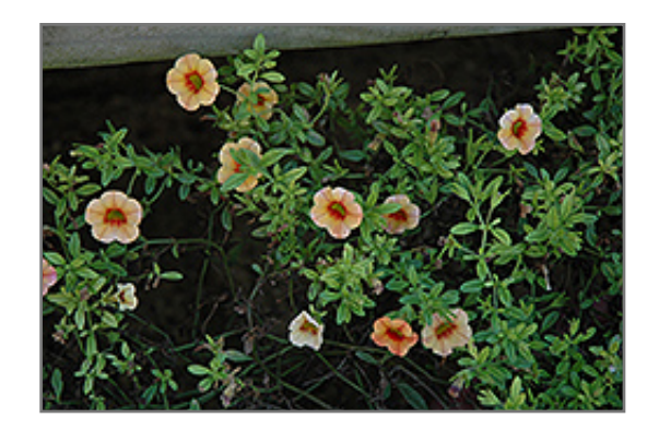
Noa Orange Eye Calibrachoa flowers