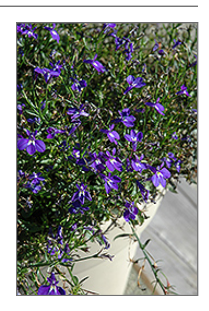
Magadi Blue Lobelia flowers

Magadi Blue Lobelia will grow to be about 10 inches tall at maturity, with a spread of 10 inches. When grown in masses or used as a bedding plant, individual plants should be spaced approximately 8 inches apart. Its foliage tends to remain low and dense right to the ground. Although it's not a true annual, this fast-growing plant can be expected to behave as an annual in our climate if left outdoors over the winter, usually needing replacement the following year. As such, gardeners should take into consideration that it will perform differently than it would in its native habitat.