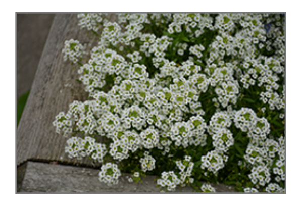
Snow Princess Alyssum flowers

Snow Princess Alyssum is a dense herbaceous annual with a trailing habit of growth, eventually spilling over the edges of hanging baskets and containers. It brings an extremely fine and delicate texture to the garden composition and should be used to full effect.