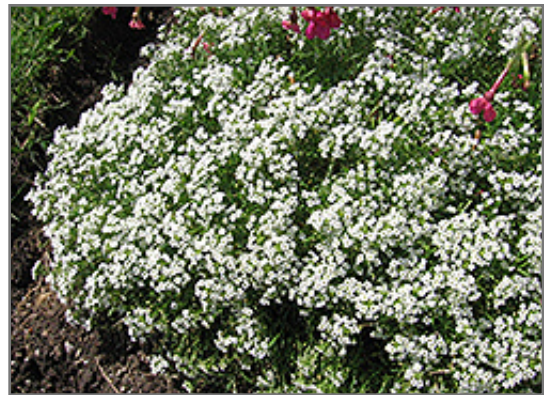
Wonderland White Alyssum in bloom