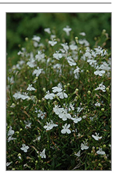
Waterfall White Sparkle Lobelia flowers

Waterfall White Sparkle Lobelia will grow to be about 8 inches tall at maturity, with a spread of 12 inches. When grown in masses or used as a bedding plant, individual plants should be spaced approximately 10 inches apart. Its foliage tends to remain low and dense right to the ground. Although it's not a true annual, this fast-growing plant can be expected to behave as an annual in our climate if left outdoors over the winter, usually needing replacement the following year. As such, gardeners should take into consideration that it will perform differently than it would in its native habitat.