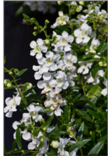
AngelMist Spreading White Angelonia flowers

AngelMist Spreading White Angelonia is recommended for the following landscape applications;