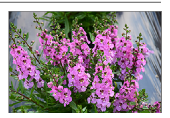
Archangel Pink Angelonia flowers