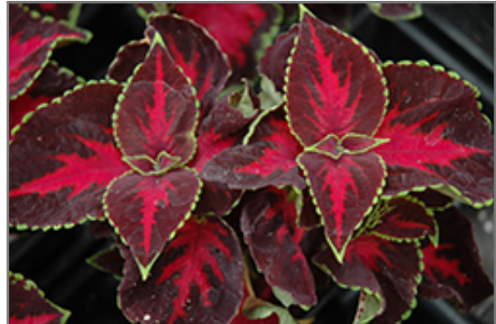
Chocolate Covered Cherry Coleus foliage