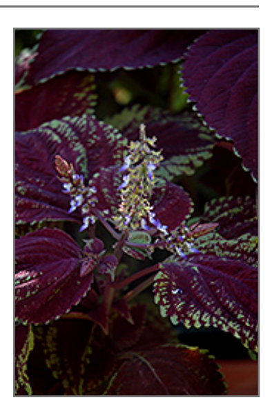
Emotions Sophisticated Coleus foliage

Emotions Sophisticated Coleus will grow to be about 3 feet tall at maturity, with a spread of 30 inches. When grown in masses or used as a bedding plant, individual plants should be spaced approximately 24 inches apart. Although it's not a true annual, this fast-growing plant can be expected to behave as an annual in our climate if left outdoors over the winter, usually needing replacement the following year. As such, gardeners should take into consideration that it will perform differently than it would in its native habitat.