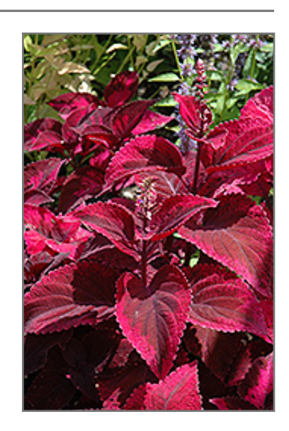
Mariposa Coleus foliage

Mariposa Coleus will grow to be about 24 inches tall at maturity, with a spread of 30 inches. When grown in masses or used as a bedding plant, individual plants should be spaced approximately 24 inches apart. Although it's not a true annual, this fast-growing plant can be expected to behave as an annual in our climate if left outdoors over the winter, usually needing replacement the following year. As such, gardeners should take into consideration that it will perform differently than it would in its native habitat.