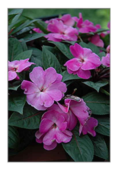
Celebrette Orchid New Guinea Impatiens flowers