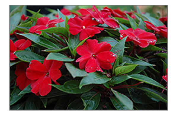
Celebrette Red New Guinea Impatiens flowers