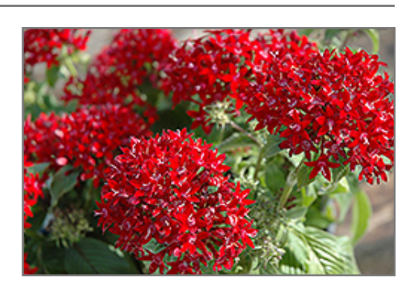
Graffiti OG Red Lace Star Flower flowers