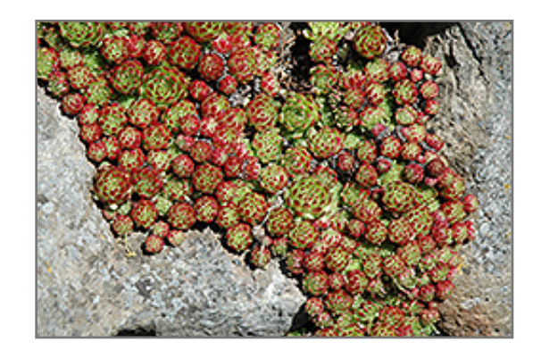
Sierra Nevada Hens And Chicks