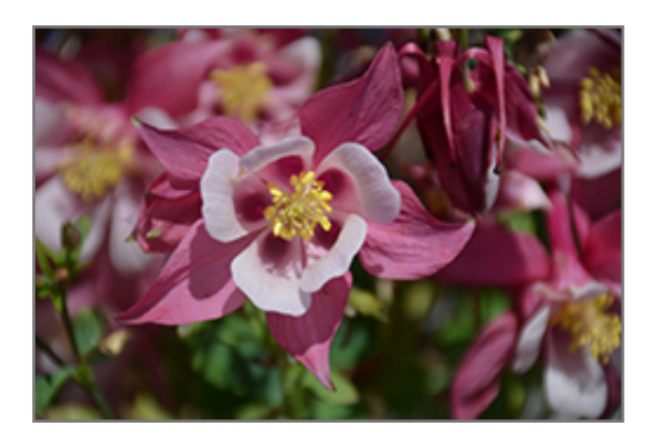
Origami Rose and White Columbine flowers