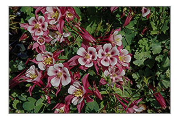
Origami Rose and White Columbine flowers