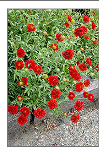
Red Plume Blanket Flower flowers