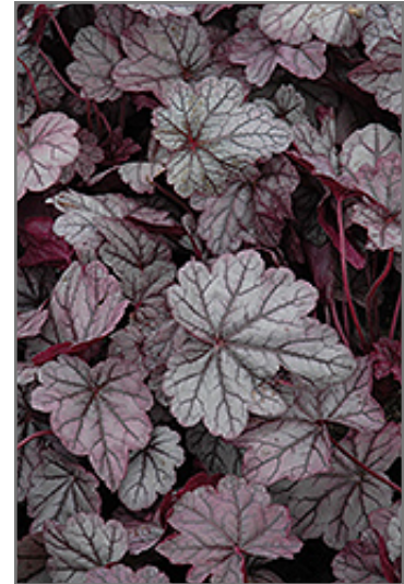
Carnival Sugar Plum Coral Bells foliage

Carnival Sugar Plum Coral Bells is recommended for the following landscape applications;