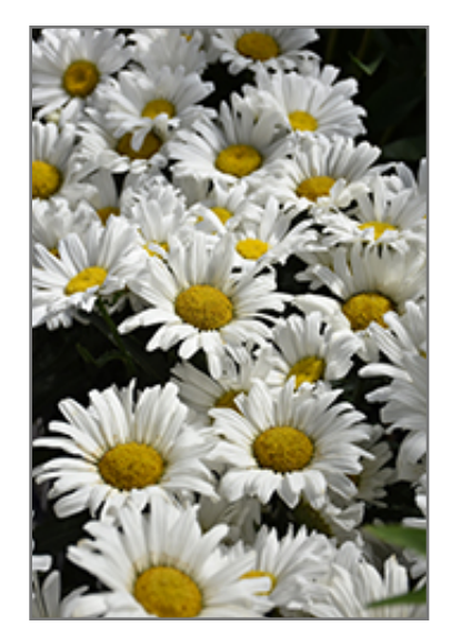
Daisy May Shasta Daisy flowers