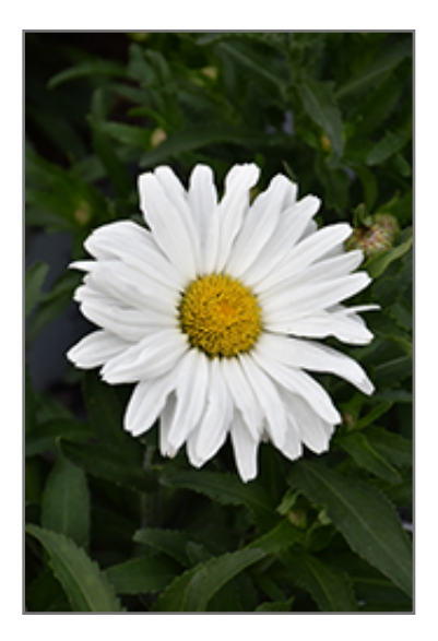
Daisy May Shasta Daisy flowers