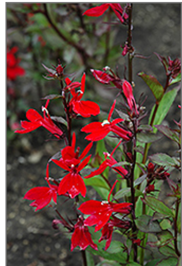
Fan Scarlet Cardinal Flower flowers