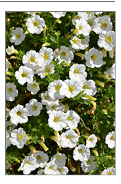
Littletunia White Grace Petunia flowers

Littletunia White Grace Petunia will grow to be about 12 inches tall at maturity, with a spread of 12 inches. When grown in masses or used as a bedding plant, individual plants should be spaced approximately 10 inches apart. Its foliage tends to remain dense right to the ground, not requiring facer plants in front. This fast-growing annual will normally live for one full growing season, needing replacement the following year.