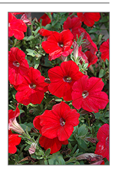
Surprise Red Petunia flowers

Surprise Red Petunia will grow to be about 18 inches tall at maturity, with a spread of 18 inches. When grown in masses or used as a bedding plant, individual plants should be spaced approximately 15 inches apart. Its foliage tends to remain dense right to the ground, not requiring facer plants in front. This fast-growing annual will normally live for one full growing season, needing replacement the following year.