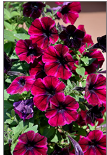
Sweetunia Johnny Flame Petunia flowers