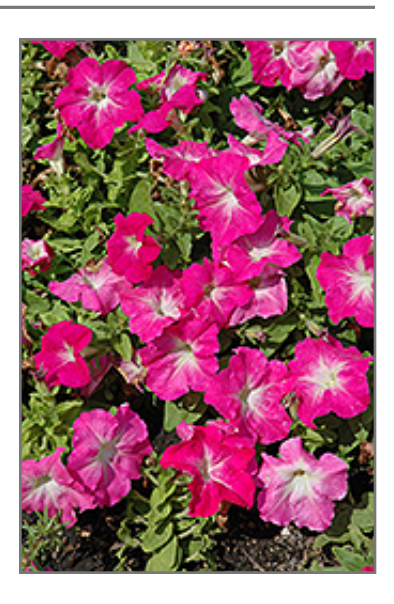
Limbo GP Rose Morn Petunia flowers

Limbo GP Rose Morn Petunia will grow to be about 8 inches tall at maturity, with a spread of 12 inches. When grown in masses or used as a bedding plant, individual plants should be spaced approximately 10 inches apart. Its foliage tends to remain low and dense right to the ground. This fast-growing annual will normally live for one full growing season, needing replacement the following year.