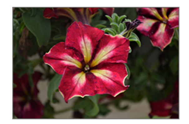
Crazytunia Mandeville Petunia flowers