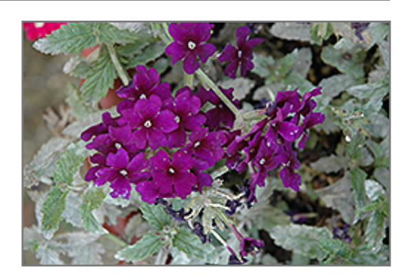
Empress Imperial Blue Verbena flowers