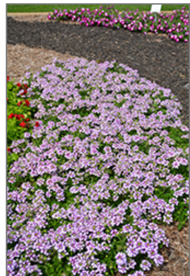
Lanai Twister Purple Verbena in bloom