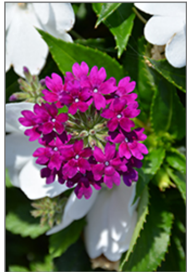
Superbena Royale Plum Wine Verbena flowers