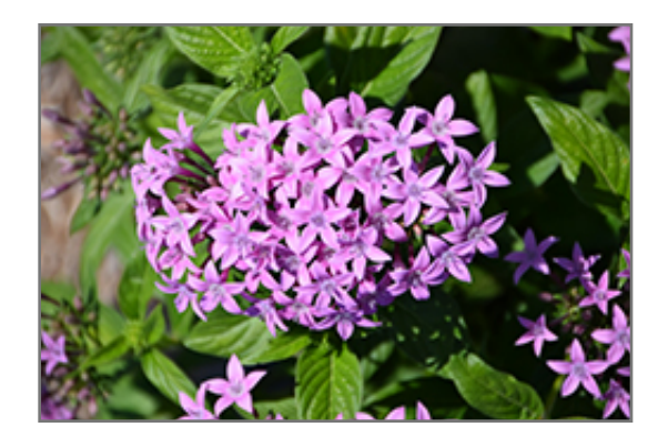
Graffiti OG Lavender Star Flower flowers