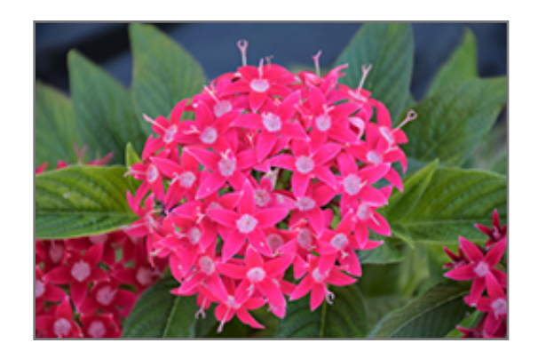
Graffiti OG Rose Star Flower flowers