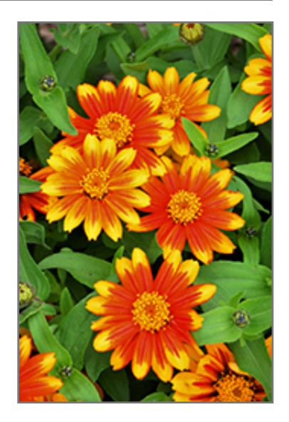
Zahara Sunburst Zinnia flowers