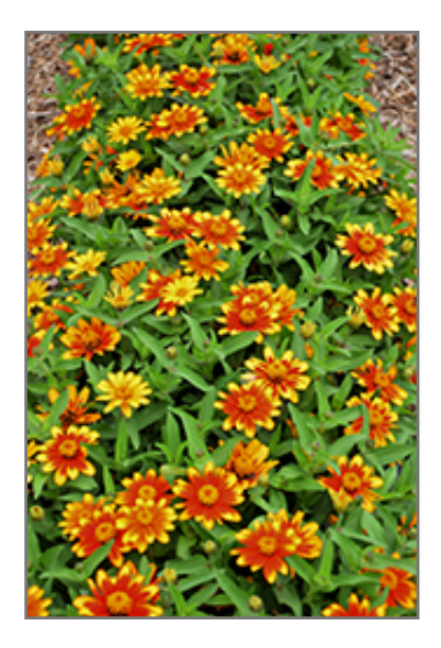
Zahara Sunburst Zinnia in bloom