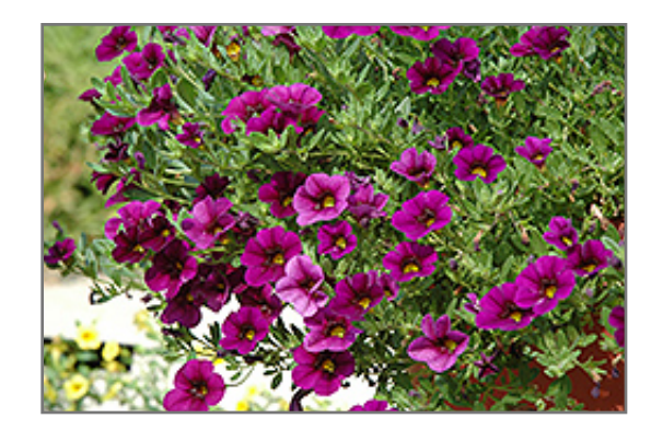
Cabaret Purple Glow Calibrachoa flowers