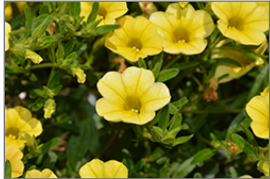
Million Bells Trailing Yellow Calibrachoa flowers

Million Bells Trailing Yellow Calibrachoa is recommended for the following landscape applications;