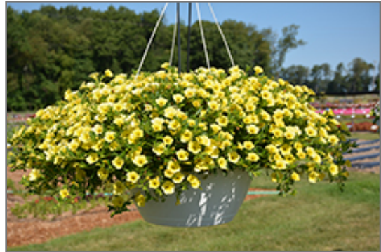
Million Bells Trailing Yellow Calibrachoa in bloom

Million Bells Trailing Yellow Calibrachoa will grow to be about 24 inches tall at maturity, with a spread of 30 inches. When grown in masses or used as a bedding plant, individual plants should be spaced approximately 18 inches apart. Its foliage tends to remain dense right to the ground, not requiring facer plants in front. This fast-growing annual will normally live for one full growing season, needing replacement the following year.