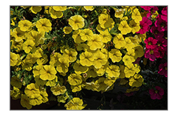
MiniFamous Deep Yellow Calibrachoa flowers