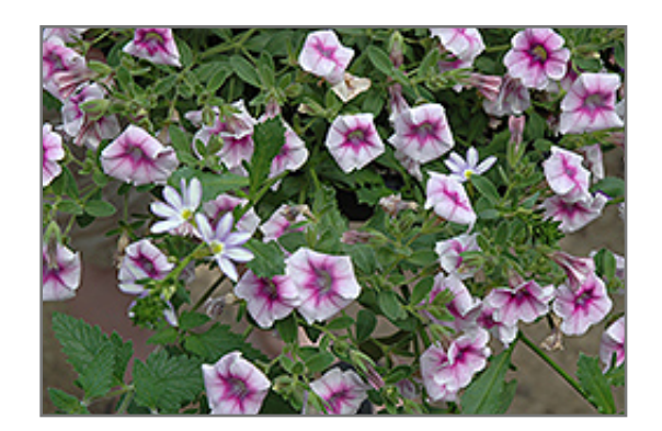
Superbells Tickled Pink Calibrachoa flowers