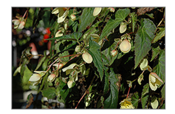
Million Kisses Honeymoon Begonia flowers