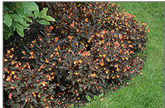
Sparks Will Fly Begonia in bloom