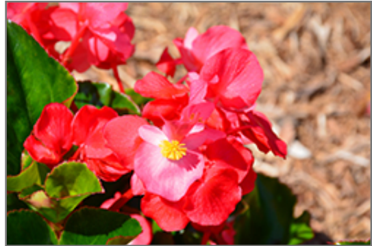
Whopper Rose Green Leaf Begonia flowers