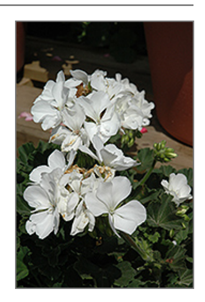
Presto White Geranium flowers

Presto White Geranium will grow to be about 8 inches tall at maturity, with a spread of 10 inches. When grown in masses or used as a bedding plant, individual plants should be spaced approximately 8 inches apart. Its foliage tends to remain low and dense right to the ground. Although it's not a true annual, this fast-growing plant can be expected to behave as an annual in our climate if left outdoors over the winter, usually needing replacement the following year. As such, gardeners should take into consideration that it will perform differently than it would in its native habitat.