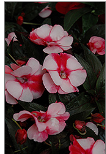
Sonic Sweet Cherry New Guinea Impatiens flowers