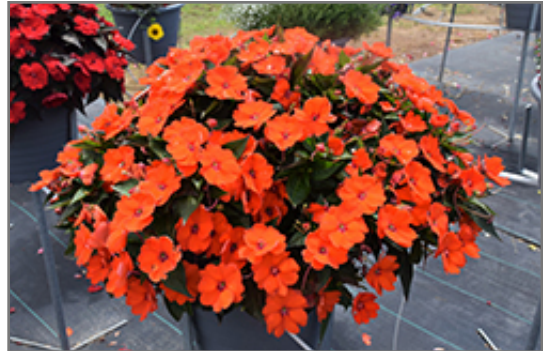
SunPatiens Compact Electric Orange New Guinea Impatiens in bloom

SunPatiens Compact Electric Orange New Guinea Impatiens will grow to be about 24 inches tall at maturity, with a spread of 24 inches. When grown in masses or used as a bedding plant, individual plants should be spaced approximately 20 inches apart. Its foliage tends to remain dense right to the ground, not requiring facer plants in front. This fast-growing annual will normally live for one full growing season, needing replacement the following year.