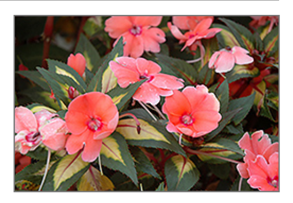
SunPatiens Vigorous Coral New Guinea Impatiens flowers