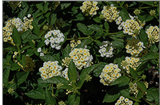
Denholm White Lantana flowers

Denholm White Lantana will grow to be about 4 feet tall at maturity, with a spread of 5 feet. When grown in masses or used as a bedding plant, individual plants should be spaced approximately 24 inches apart. Although it's not a true annual, this fast-growing plant can be expected to behave as an annual in our climate if left outdoors over the winter, usually needing replacement the following year. As such, gardeners should take into consideration that it will perform differently than it would in its native habitat.