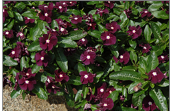
Jams 'N Jellies Blackberry Vinca flowers