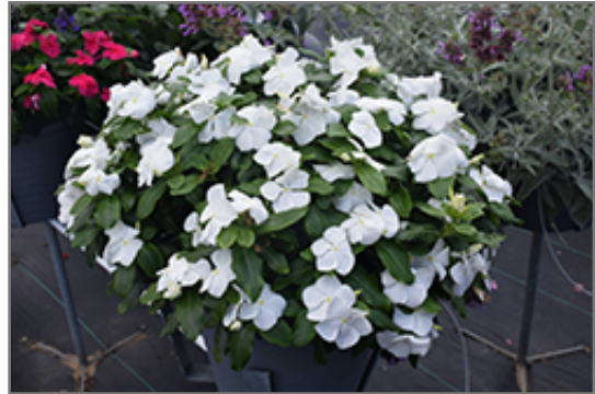
Titan Pure White Vinca in bloom

Titan Pure White Vinca will grow to be about 14 inches tall at maturity, with a spread of 12 inches. Its foliage tends to remain dense right to the ground, not requiring facer plants in front. Although it's not a true annual, this fast-growing plant can be expected to behave as an annual in our climate if left outdoors over the winter, usually needing replacement the following year. As such, gardeners should take into consideration that it will perform differently than it would in its native habitat.