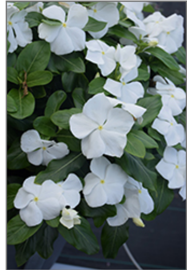
Titan Pure White Vinca flowers

Titan Pure White Vinca is recommended for the following landscape applications;