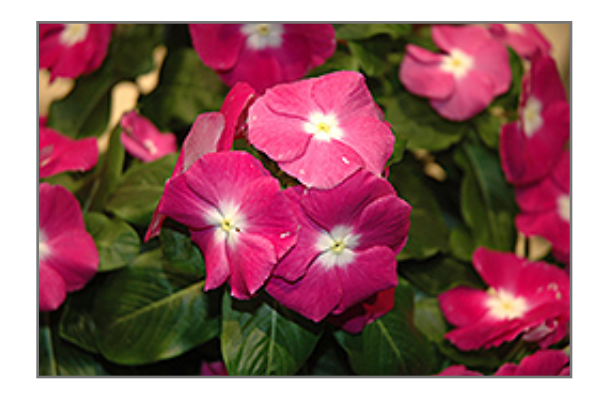
Vitesse Lavender Morn Vinca flowers