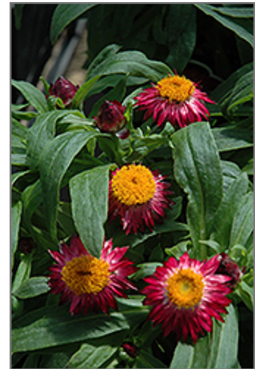
Mohave Dark Red Strawflower flowers