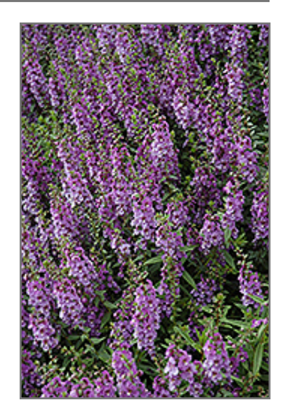
Serenita Blue Angelonia flowers