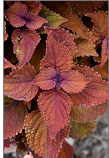
Wall Street Coleus foliage